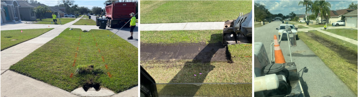
(Above: Before, during and after swale clear out)

The District recommends a title search before buying property to uncover easements. All properties have a 6-foot side yard and an 8-foot rear easement for utilities or drainage, but larger ones may apply. Structures are prohibited in these easements. You can request an easement vacation, but approval is uncertain and requires Orange County's review.