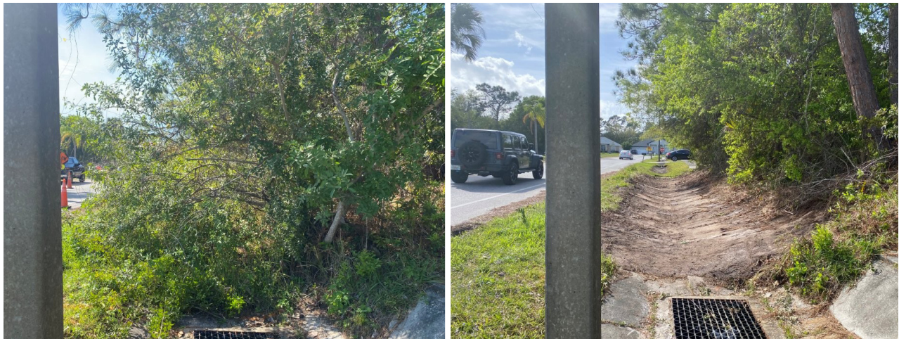
(Above: Before and after debris removal from a swale)

Keep irrigation lines out of the road right of way. The District maintains swales, any irrigation lines found will be removed without replacement.