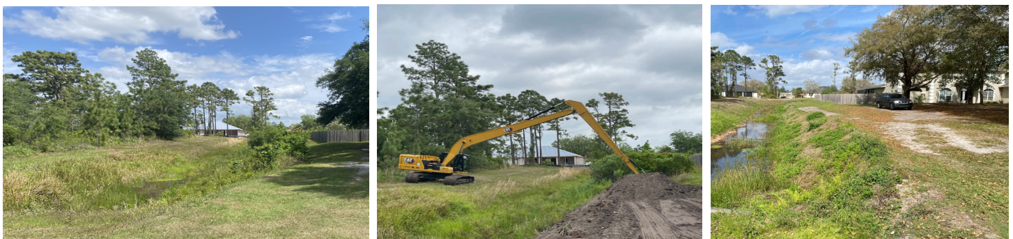
(Above: Before, during, and after easement cleaning)

Roadside swales play an essential role in drainage and in filtering pollutants before they reach the Econlockhatchee River, which is designated as an Outstanding Florida Waterbody. It is imperative for homeowners to maintain driveway pipes and swales by keeping them free of grass and debris to ensure proper stormwater management. Swales may hold water for up to 72 hours after heavy rain; if water remains longer, contact the District Office.